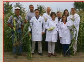
The Mad Science Research and Development team after learning about recent developments in corn harvesting.